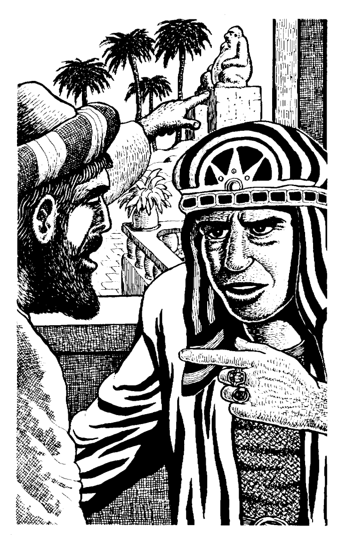
Amaziah was riled and embarrassed when a prophet of God accused him of secretly indulging in idol worship.

"You are aware of what men of your nation